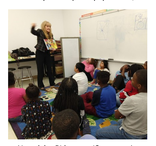
New club: Ridgecrest /Commerce!

Have you considered partnering with CEF days, and our office provides that!